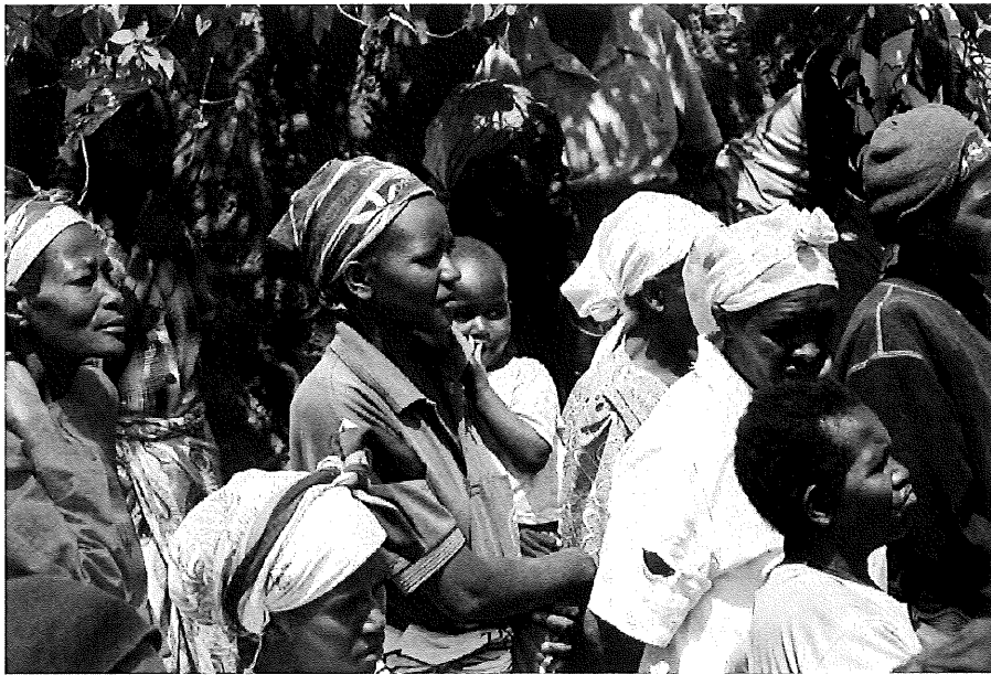
Those who promote the term infant mental health embrace a holistic view of the infant in the context of family and community.

the workplace, serving especially vulnerable families, striving for inclusivity). Such efforts are shared among all infant mental health professionals and supported by agency and community policies.